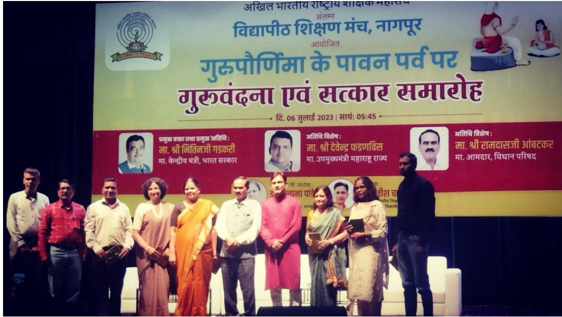
Felicitation of Bos Members by RTMNU, Nagpur(23-24)