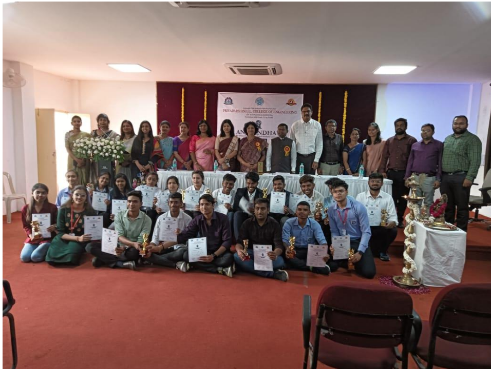
Anusandhan 2K24 , Price Distribution 2023-24