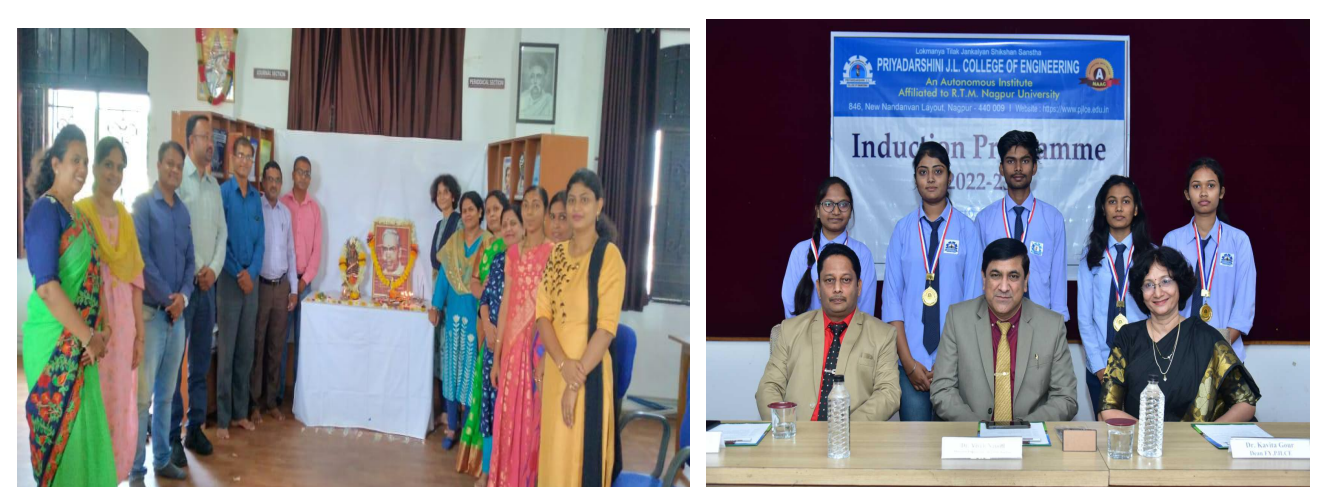
Jhaulal Jayanti celebration