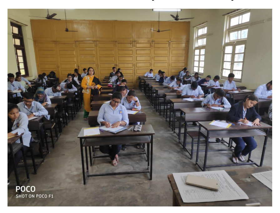
Quiz Compitition for 12th students