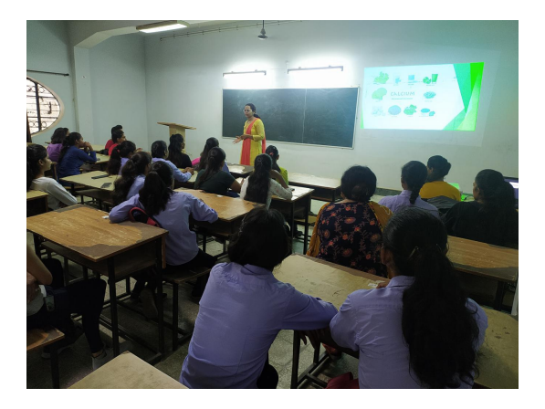
Guest Lecture on Womens Hygine