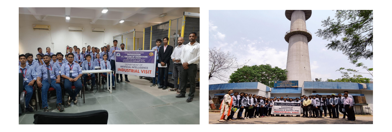
Industrial visit _AI Dept

To give the Final year students a practical approach and to develop their technical skills & proficiency, every year our institute (Civil, CSE, EN/ETC, EE,) organize Industrial Visits/Tours. Students visited various companies like , Persistant Nagpur, Dotsquare Technologies Pvt. Ltd Jaipur, Global Logic India Pvt. Ltd, Yalamanchili, Nagpur, KEC International(Butibori, Nagpur), Water Treatment Plant (Pench-I) Gorewada, Nagpur, Visit to Seawage Water Treatment Plant, Bhandewadi, Industrial Tour to (North India), Delhi Doordarshan Kendra, Nagpur, Visit at Transformer Manufacturing Industry Jaipur and Sunflag Steel Bhandara.