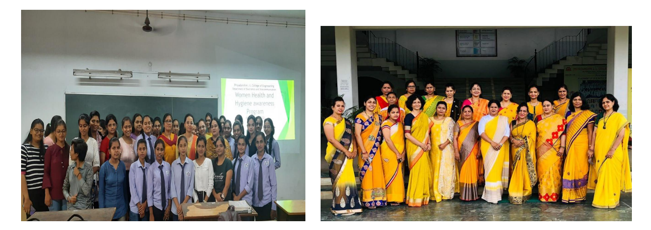
Guest Lecture on Women health & Hygiene

Women's empowerment refers to the ability for women to enjoy their right to control and benefit from the resources, assets, income and their own time, as well as the ability to manage risk and improve their emotional and economic status and their well being. We at PJLCE organize various events under this banner.