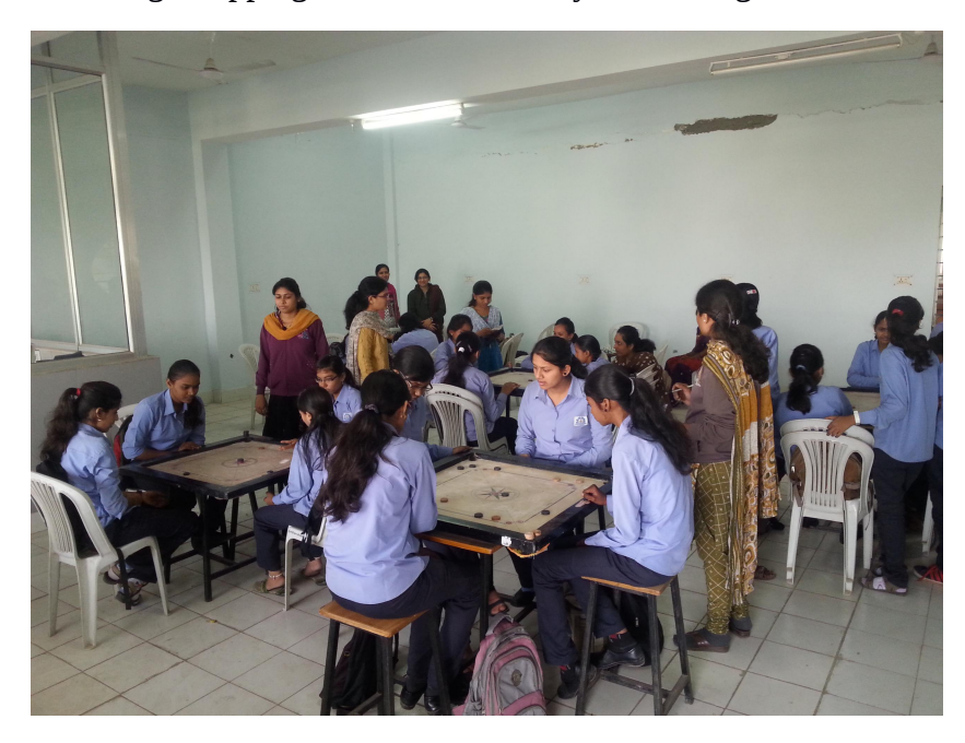
Indoor Games :Carrom

PJLCE's evergreen ambiance having a large playground and enough provisions for indoor as well as outdoor games. Sports motivates our students to be physically and mentally strong. They actively participate in several indoor and outdoor games such as Table Tennis, Cricket, Volleyball, Badminton, Kho-Kho, Chess, Carom, Running, Skipping, Kabaddi and many more fun games.