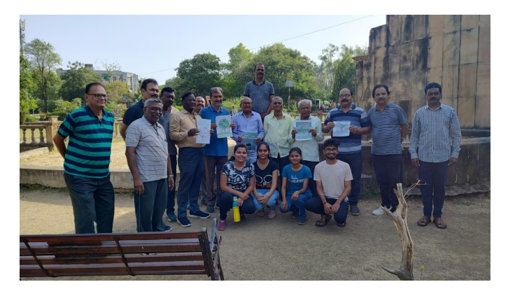
World Environmental Day with senior cityzens